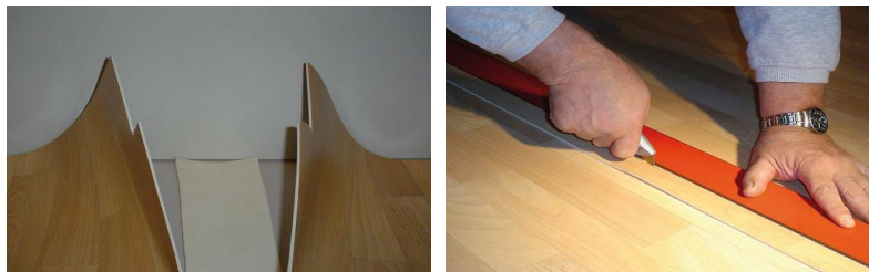
Scrap piece placed under the seam - double cut with a straight edge