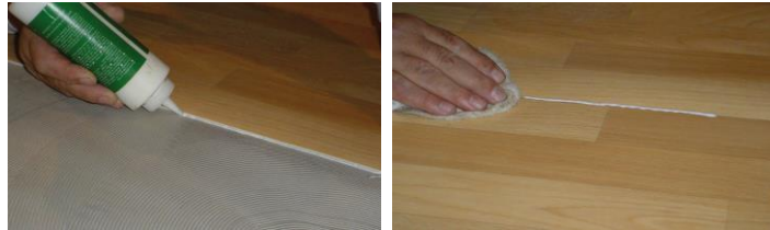
Beauflor Seam Bond application and clean up with a damp cloth